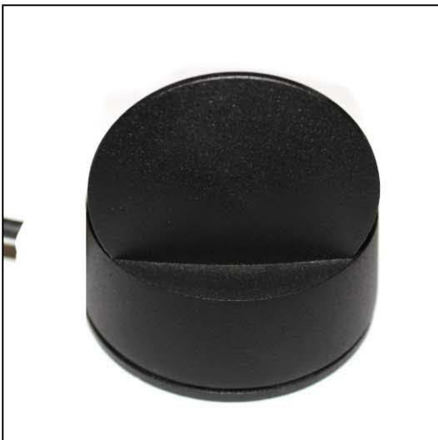
Strong Aluminium Body