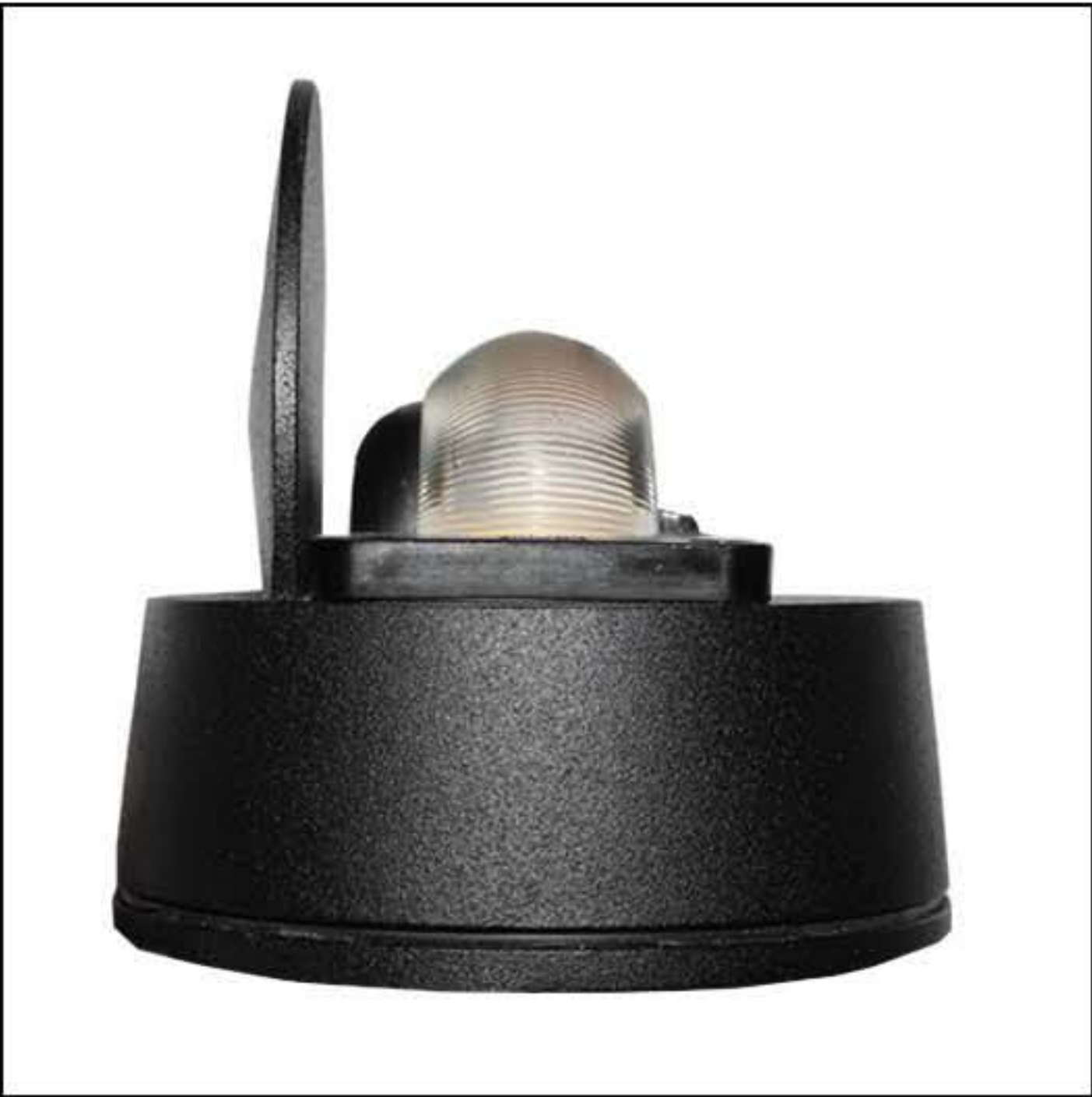
Optical Silicon Lens With PC Base