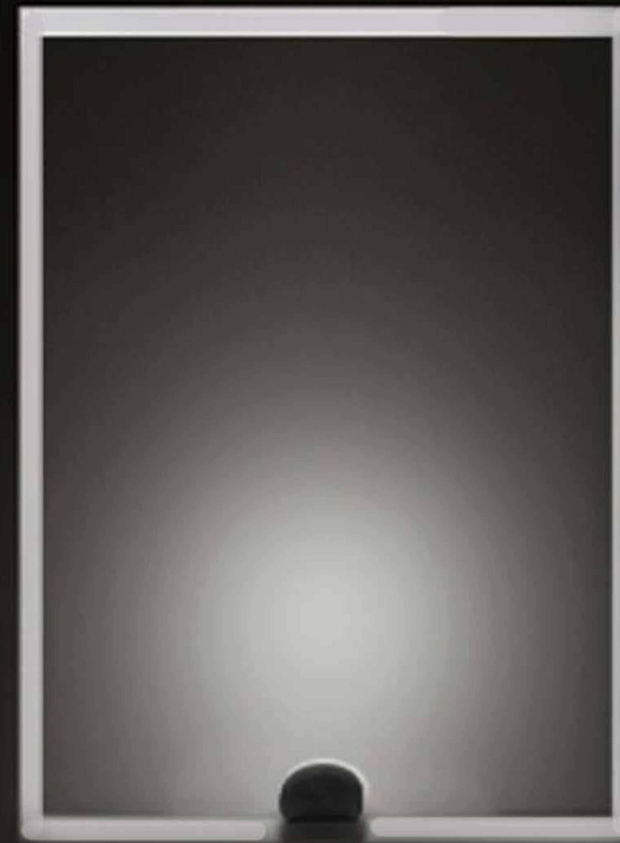
SINGLE FLAP LIGHT