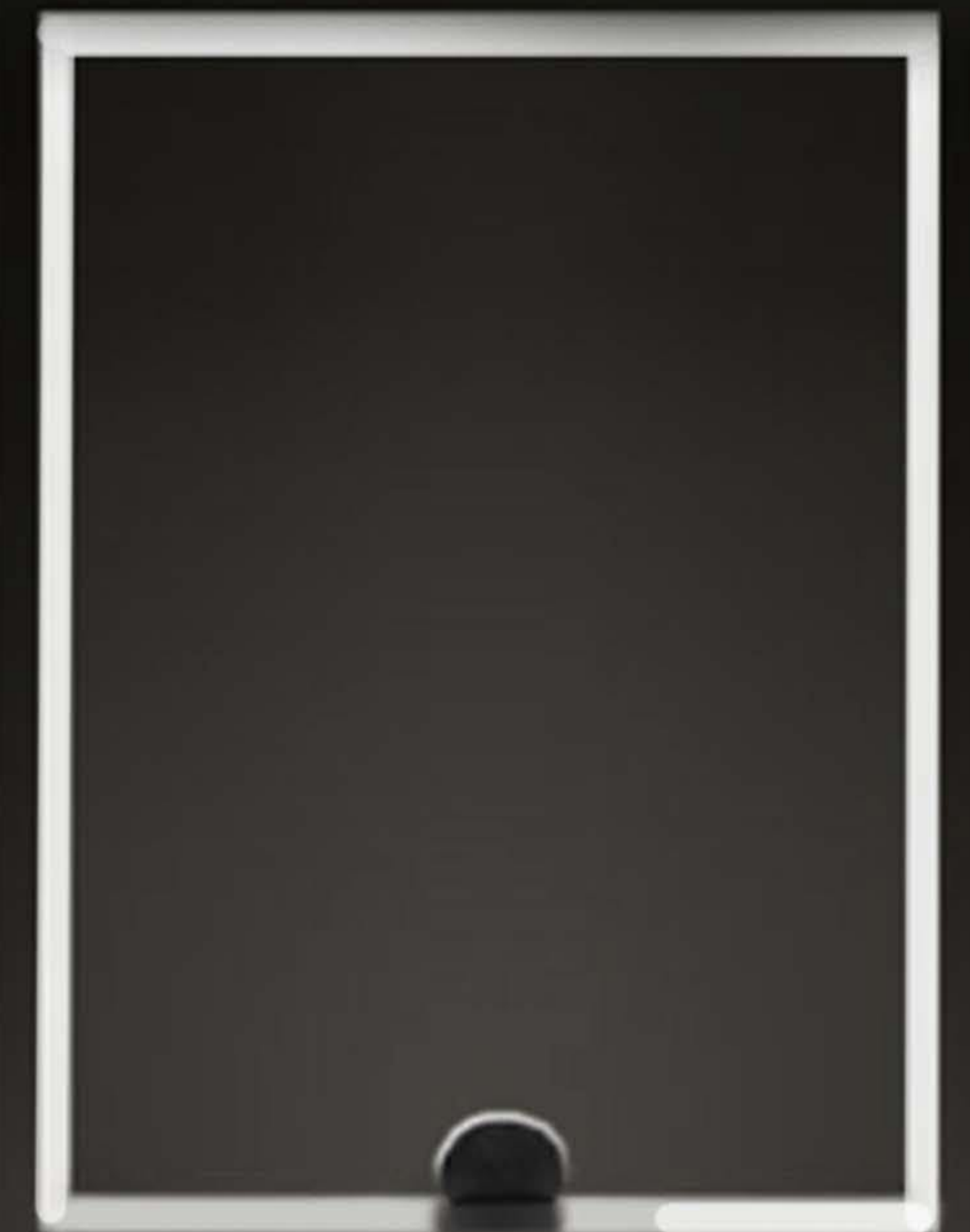
DOUBLE FLAP LIGHT