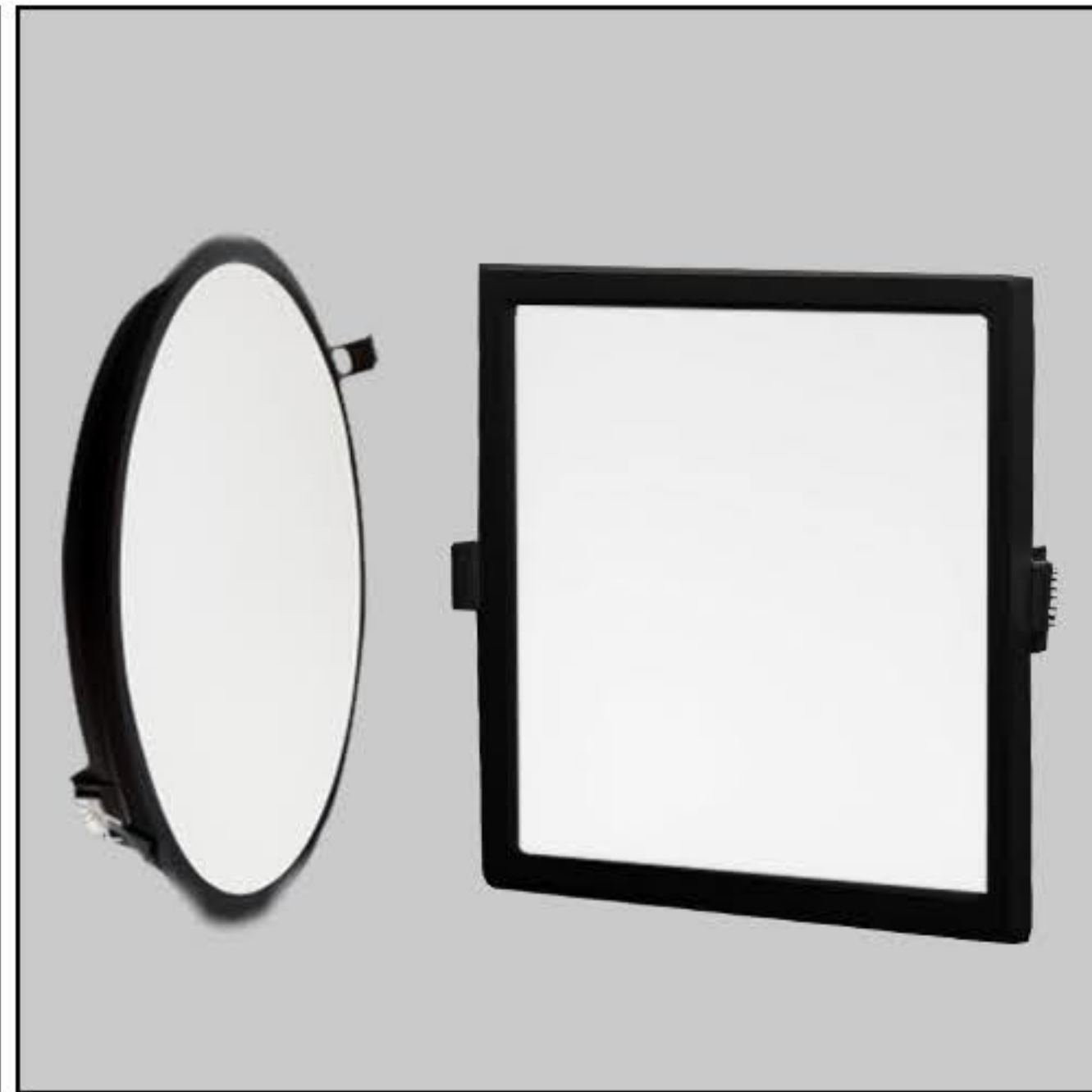
Available Finish - White & Black